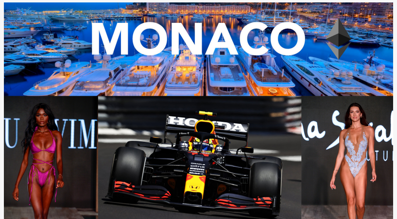
Monaco F1 Experience NFT On Rarible gives access to Race Viewing, Fashion Shows, Parties and unique digital Artwork.