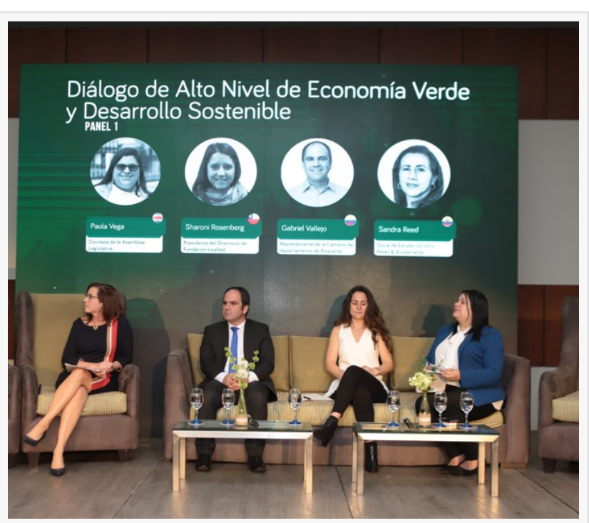
A panel of experts discuss a green economy at the Premios Verdes Sustainability Festival in 2019.

□Ministers of Environment from the United Kingdom, Colombia, Uruguay, Panama, Argentina, and Ecuador among featured speakers