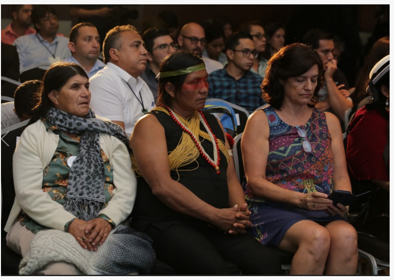
Attendees from all walks of life that care about environmental awareness gather at the Premios Verdes Sustainability Festival.

The public – and industries interested in environmental awareness strategies