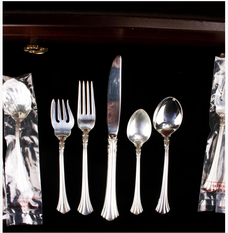
18th century Reed & Barton sterling silver service with many serving pieces, for a total of 47 pieces, new in the wrapping, never used, includes a two-level silver chest (est. $2,000-$4,000).

Two lighting-related lots have estimates of $200-$400. The first is an antique wrought iron Gothic Revival pendant light, hexagonal form, with twisted columns and decorated with flower and bud ornamentation. The second is a pair of sterling weighted