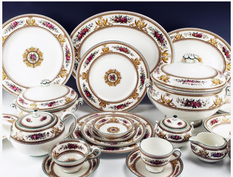
Large service for twelve with serving pieces by Wedgwood in the Columbia pattern, including eight Leigh-shaped cups, six Avon cups and a soup tureen with handles (est. $500-$800).