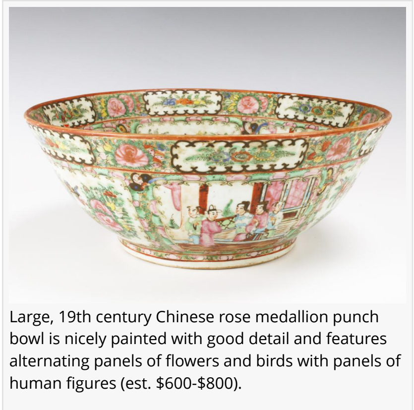
Large, 19th century Chinese rose medallion punch bowl is nicely painted with good detail and features alternating panels of flowers and birds with panels of human figures (est. $600-$800).

While the event is Internet-only, with no in-person gallery bidding, online bidding is available at LiveAuctioneers.com, Invaluable.com and ConverseAuctions.com. Live previews will be available by appointment only in Converse Auctions' gallery at 1 Spring Street in Paoli, Pa., near