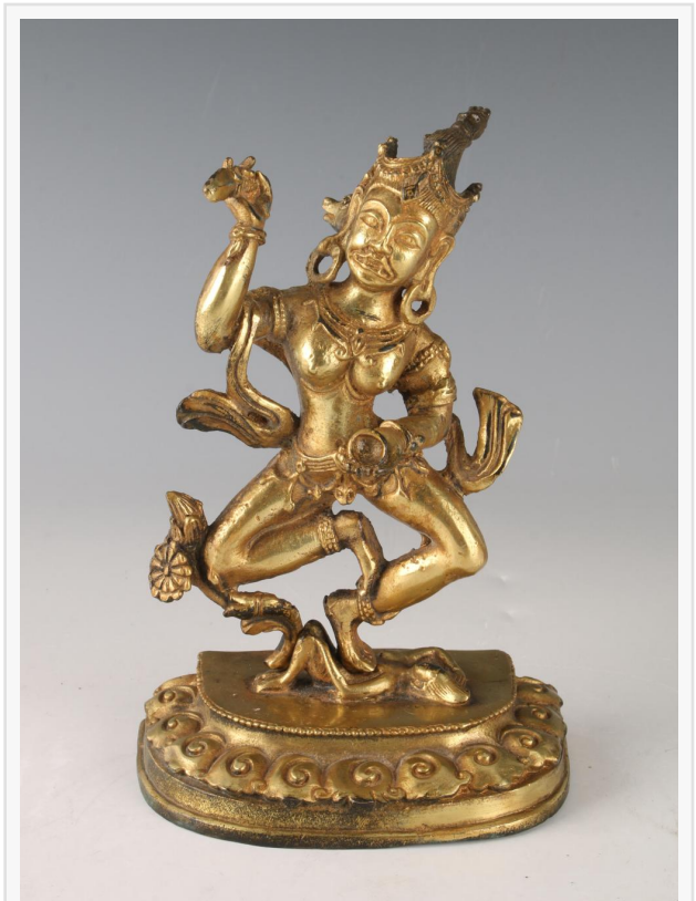
Bronze goddess statue shown standing atop a human figure, wearing jewels, a headdress and holding a vajra, 7 ½ inches tall and marked on the base (est. $400-$600).