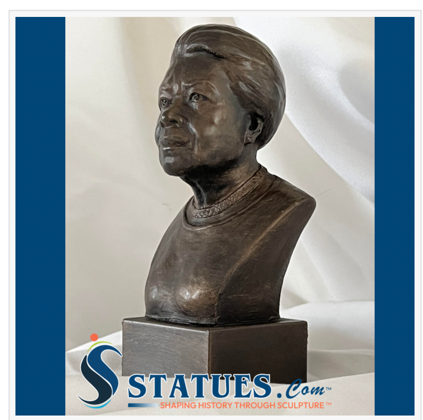
Maya Angelou bronze sculpture by Statues.com

Statues.Com is now a licensed provider of the Maya Angelou™ image. Each bust created by Statues.Com is now an officially licensed product.