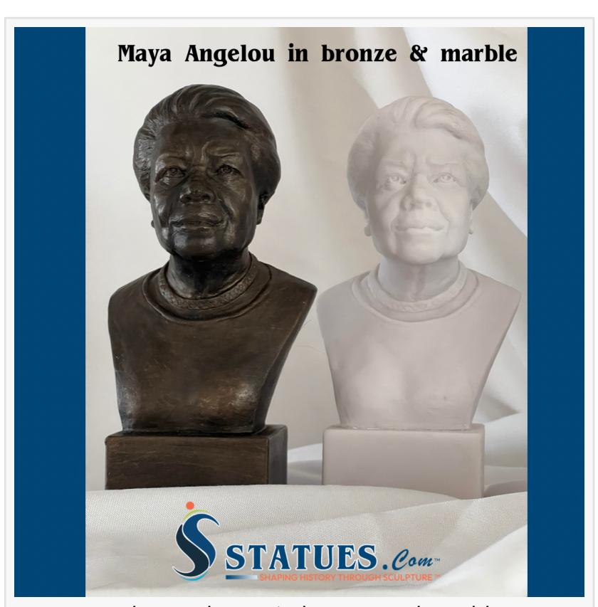
Maya Angelou sculpture in bronze and marble

Angelou™ (1928–2014), published several collections of poetry, but her most famous was 1971's collection, "Just Give Me a Cool Drink of Water