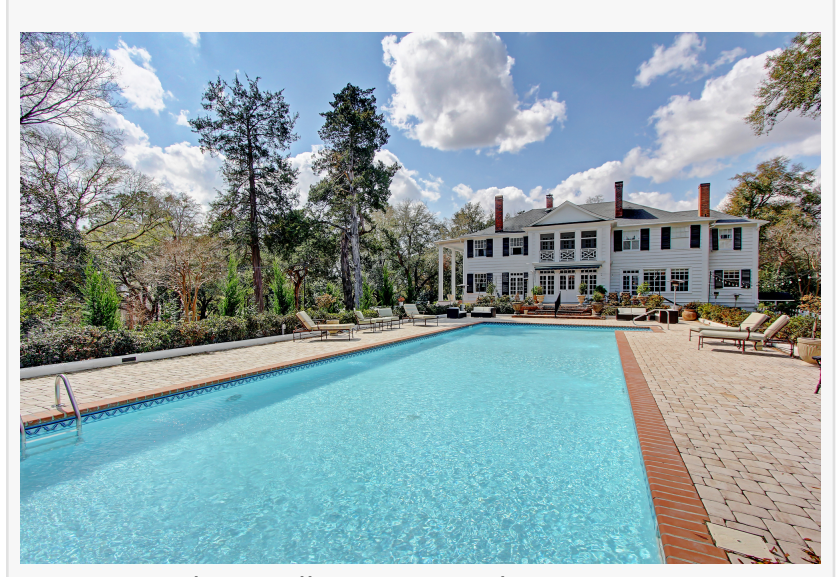
Historic Cedar Knoll Estate - Pool

Southern architecture is known for, specifically with the main house's two-story, columned porch and spacious foyer with a grand, mahogany staircase. The 7,600± sqft main house boast 6 bedrooms (including two masters), 6 full bathrooms, and 2 half baths. Ideal for entertainment, the first floor features ample living areas, including a grand dining room with separate seating area, and a library known as the Pecky Cypress room – paneling from Scotland. The downstairs