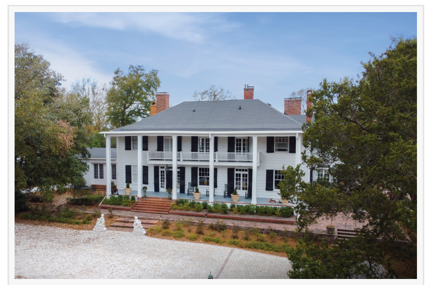
Historic Cedar Knoll Estate - Front

Known locally as the Cedar Knoll Estate, the property has been meticulously renovated to include modern updates, all while showcasing the property's historic character. Originally built in the 1830s, the property maintains the grandeur that