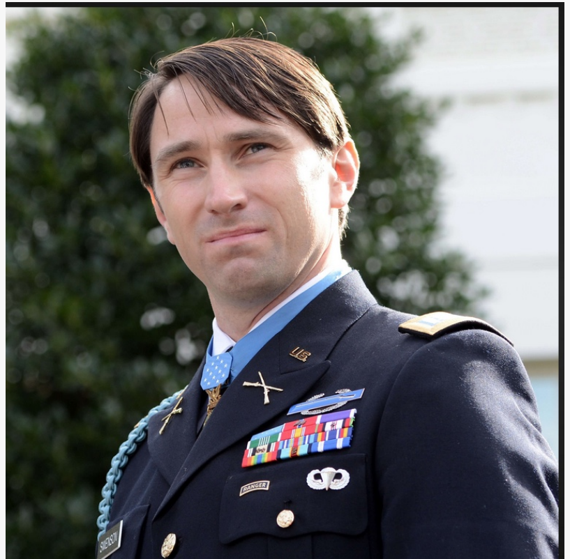
Photo of Texas Veterans Parade 2022 Grand Marshall, MOH Will Swenson