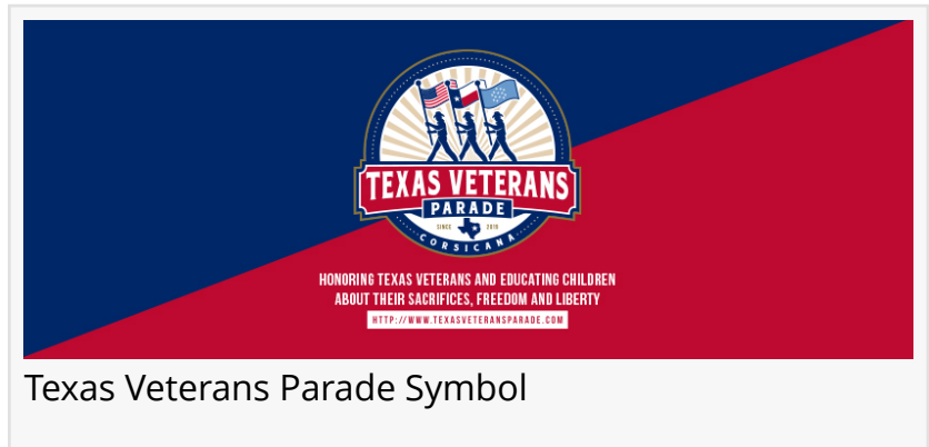
Texas Veterans Parade Symbol

CORSICANA, TX, USA , April 12, 2022 /EINPresswire.com/ --