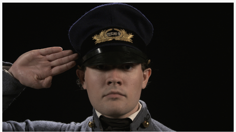
Uniform of a West Point Cadet circa 1860