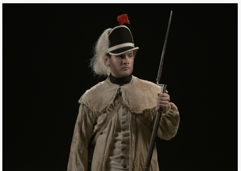
Yorktown Light Infantry 1781