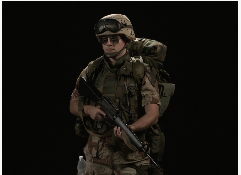
Operation Desert Storm 1991

This press release can be viewed online at: https://www.einpresswire.com/article/568343515 EIN Presswire's priority is source transparency. We do not allow opaque clients, and our editors try to be careful about weeding out false and misleading content. As a user, if you see something