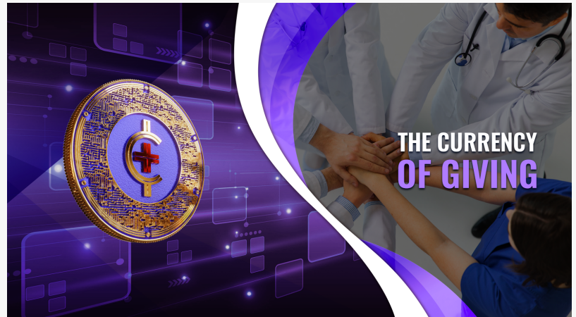
CareCoin; The Currency of Giving

“Care Coin sets itself apart with its overarching mission; To become the Currency of Giving; what we mean is that with every sell and every buy transaction, we take 2%, and put those coins into a