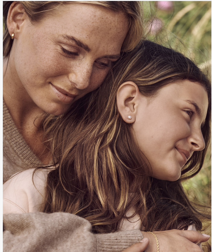
Safe & Sanitary Ear Piercing