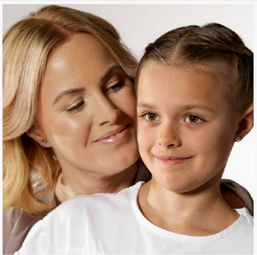
Ear piercing for all ages