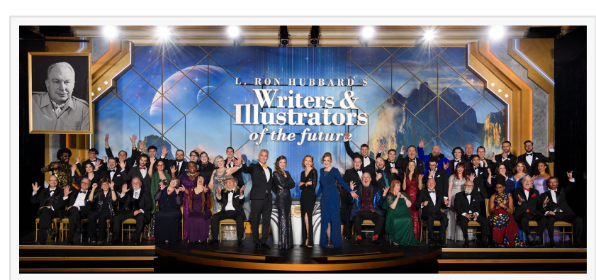
Writers & Illustrators of the Future Winners and Judges for 2022 posing on stage at the Awards Gala

HOLLYWOOD, CA, UNITED STATES, April 13, 2022 /EINPresswire.com/ -- On the evening of Friday, April 8, 2022, Hollywood returned to its resplendent glamour and elegance with the <u>38th Annual L. Ron Hubbard Achievement</u> Awards Gala for Writers and