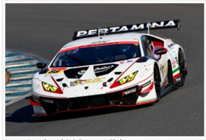
Japan Lamborghini Owners Club

In its early stages, PRIMEZ will feature diamonds selected by world-class gemologist Naokazu Kudo, along artworks using diamonds as well as Lamborghini artworks from the Super GT race in cooperation with JLOC (Japan Lamborghini Owners Club). Moreover, it will also feature works of calligraphy created by the most renowned calligraphers Kenshin. All of