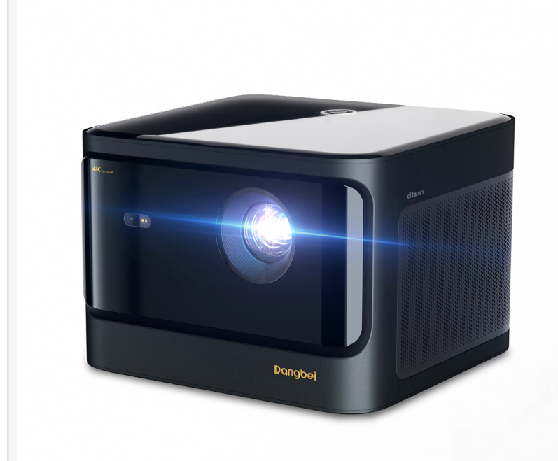
Dangbei alunching Mars Pro 4k Projector