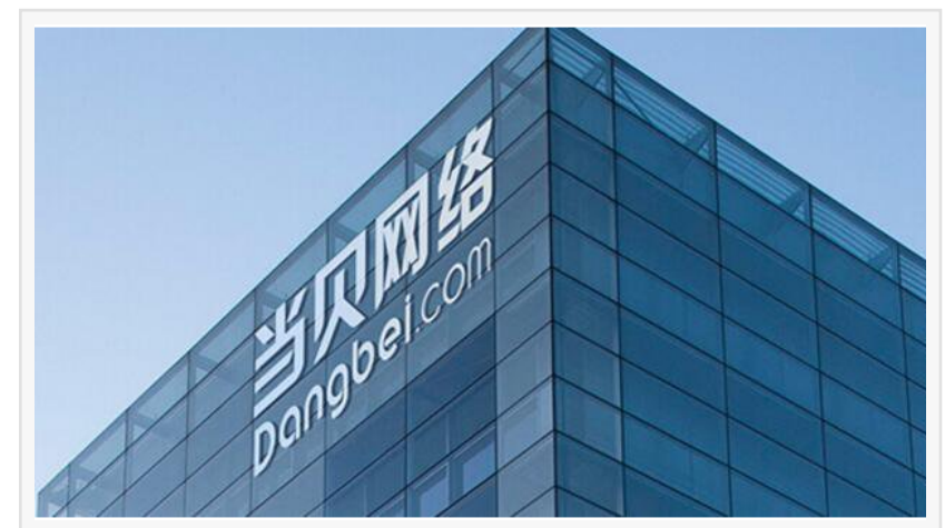
Dangbei projector market share ranks No.2 in the industry

Currently, Dangbei was awarded the "2021 Projection Times Outstanding Brand Award" at the "Projection Times Large Screen Festival 2021" (hereinafter referred to as "PJ Festival") for its 2021 smart box and smart projector hardware products, which have a forward-looking "driving effect" on the "high-quality development and