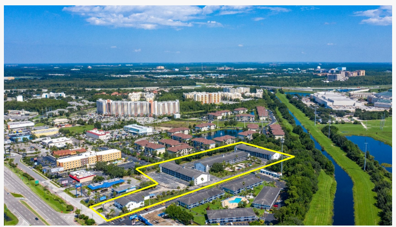
Aerial photo showing the outline of Celebration Village and its proximity to Disney.

Andrea Gower T2 Capital Management +1 6305909511 info@t2investments.com Visit us on social media: LinkedIn