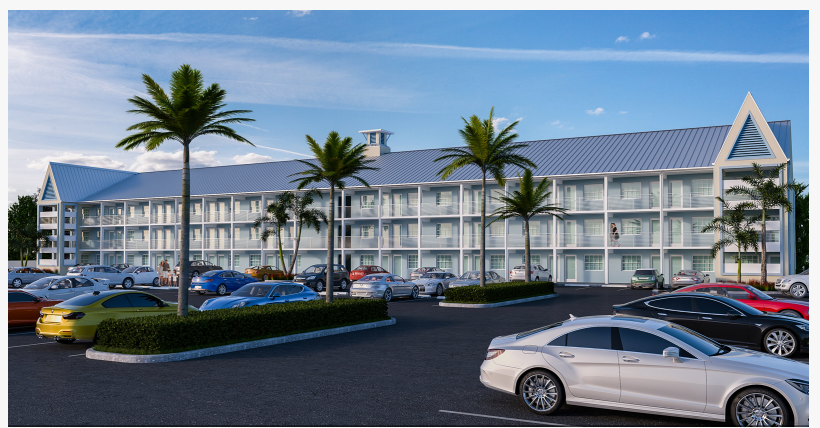
Proposed rendering of Celebration Village.

project, at 6051 West Irlo Bronson Memorial Highway, Kissimmee, Fla. T2 will bring the three existing partially completed buildings up to code, convert them to 260+ apartments, and upgrade all interiors to provide a quality multi-family living experience at below market rents.