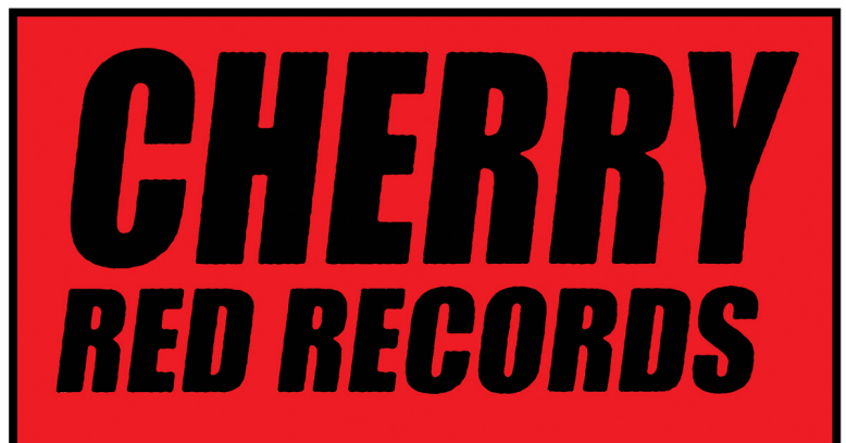
Cherry Red Records