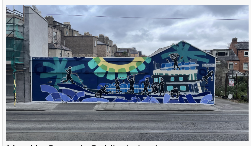
Mural by Decoy, in Dublin, Ireland

concerns at sea globally. The project seeks to not only produce polished, narrative investigative journalism, but also to amplify that reportage by converting it into other other mediums to reach new audiences all over the world.