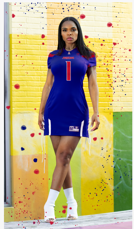
Authentic Jersey Dress in University of Arizona Wildcats colors