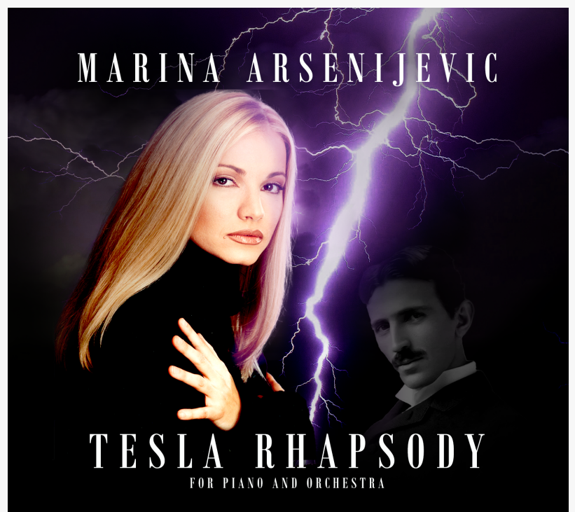
Tesla Rhapsody Cover page

TESLA RHAPSODY is composed for solo piano and symphony orchestra combining elements of classical music, folklore, jazz and blues. It is a multilayered rhapsodic piano structure with