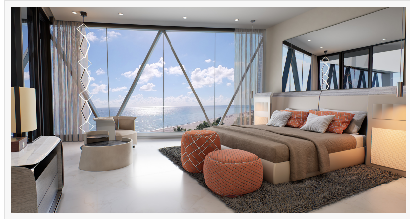
Bentley Residences Miami Bedroom Rendering

Bentley Residences will be built and designed by the unrivaled Sieger Suarez Architects and Dezer Development who collaborated on the design of the Porsche Tower. The collaborators ensure that the plans for the Bentley Residences are in the most trustworthy and capable hands. The magnificent high-rise luxury condo development which will be ready in