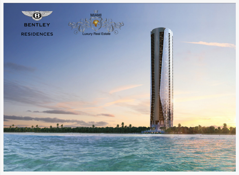
Bentley Residences Miami Exterior Rendering

extensive social networks, and expertise in marketing luxury properties therefore clients are