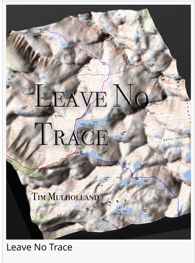
Leave No Trace

Fred is the innocent backpacker accidentally caught in a web of intrigue when he encounters Kim, a kidnapped computer security systems analyst who has just fled her captors along the back trails of the Sierra Nevada mountains. The outdoors-savvy Fred agrees to help Kim, and the two combine their expertise to devise a way out by embracing the backpackers' credo: leave no trace.