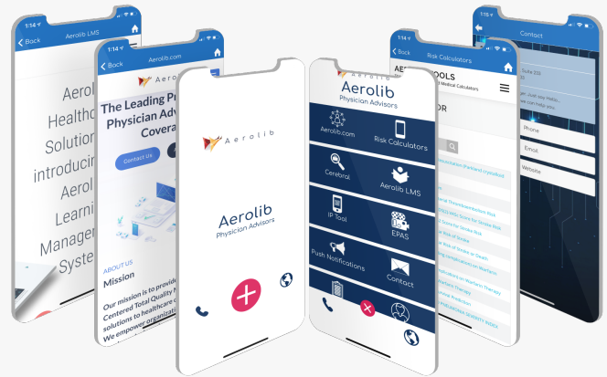
Aerolib Appeals and Denials is integrated in the Aerolib 1 Click UR app

Aerolib Medical Necessity Advisors are Experts in Utilization Review for Medical Necessity, Audits & Denials.