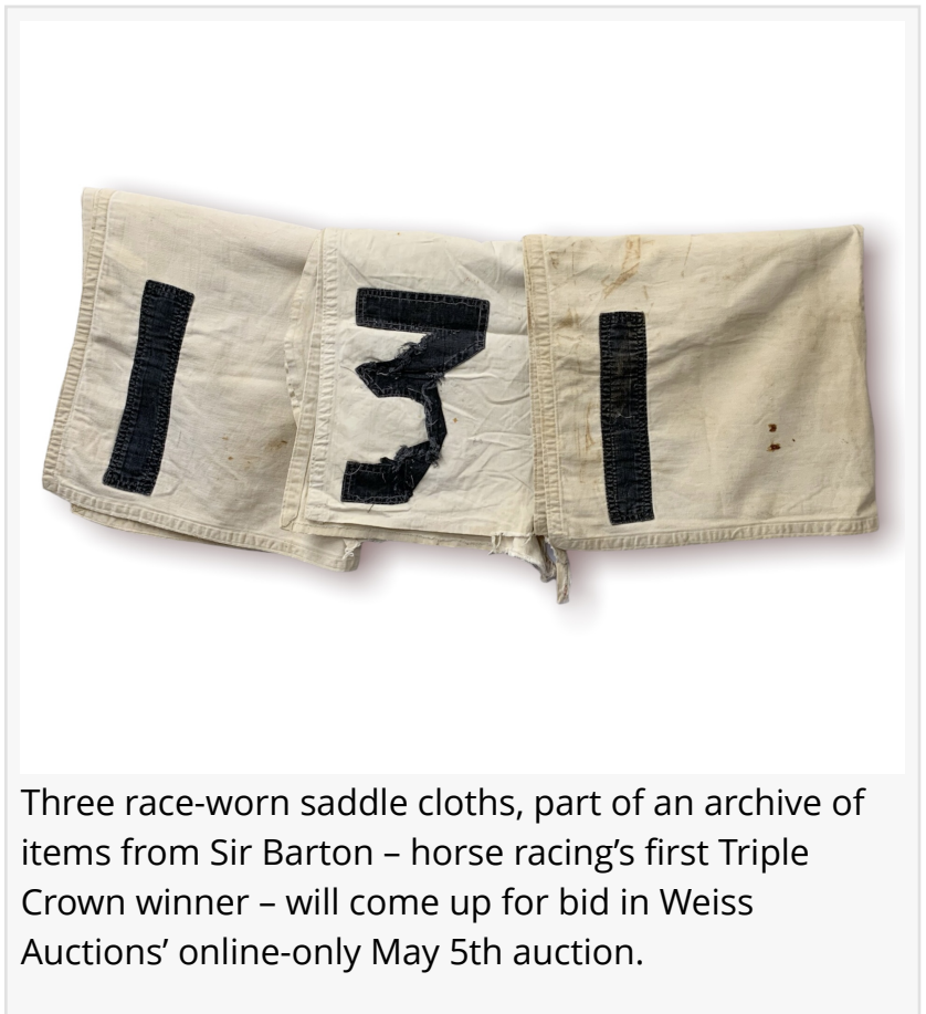
Three race-worn saddle cloths, part of an archive of items from Sir Barton – horse racing's first Triple Crown winner – will come up for bid in Weiss Auctions' online-only May 5th auction.