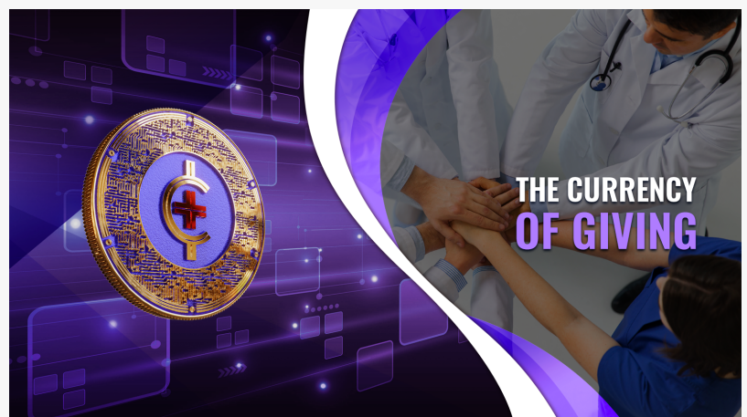
CareCoin; The Currency of Giving

While the focus of most cryptocurrency projects is to maximize profit for holders by serving as viable investment instruments, CareCoin offers the same perks but with the added benefit of being a charity token. The developers have revealed that the new cryptocurrency will donate 2% of every transaction to various humanitarian and socio-economic causes which will be chosen by holders.