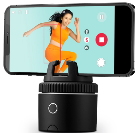
Motion Tracking AI-Technology for Content Creators