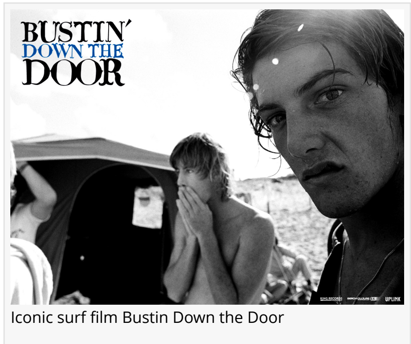
Iconic surf film Bustin Down the Door

there not only to watch this great film, but to take part in surfing history."