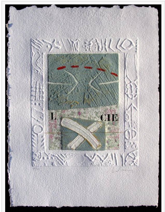
Art print "Poeme de Sable III" by Alain Suocasse