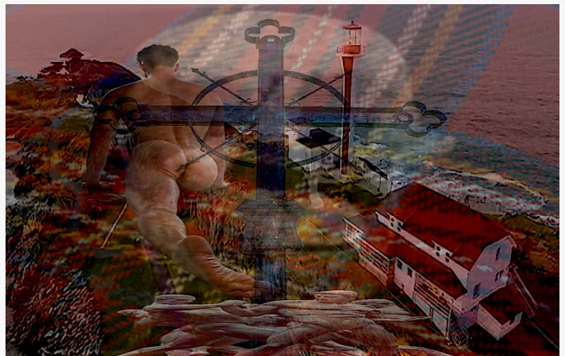
Scarlett Tartan Cap Forchu Nova Scotia Heritage Patrimonial times passing