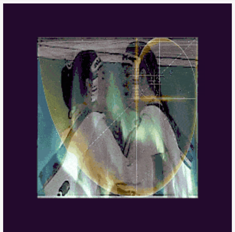
Contemporary Canadian Artwork of Inuit Throat singer sisters motion graphic NFT Monolith

The entire collection has Fountain Head Objectivism's main pillar beliefs of objective reality. absolute reason. individuality. laissez-faire capitalism is etched into the experience designs.