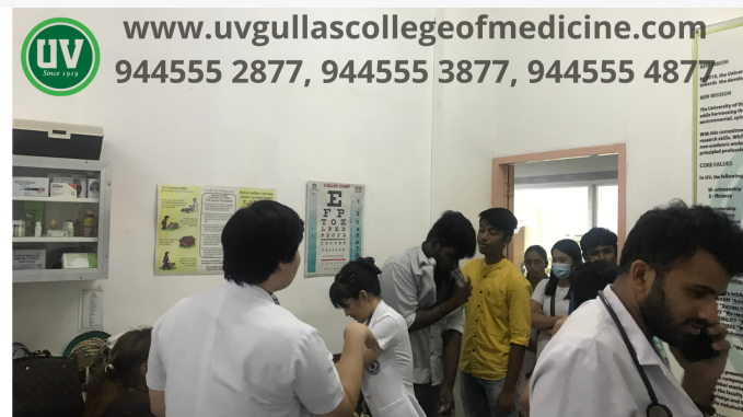
UV Gullas College of Medicine students doing MBBS in Philippines and practicing to be frontliners

MBBS in the Philippines at UV Gullas College of Medicine , one of the premier medical schools in the country. The UV Gullas College of Medicine has a world rating of 6650 for excellence and is the third best Philippines Medical College for studying MBBS in the Philippines. Most Indian middle-class families today prefer MBBS in the Philippines because they consider Philippines Medical Colleges to be the greatest medical schools in the world, offering high-quality education at reasonable prices.