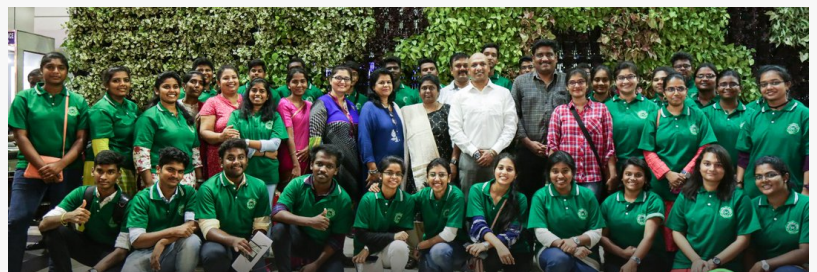
UV Gullas College of Medicine Airport Send off