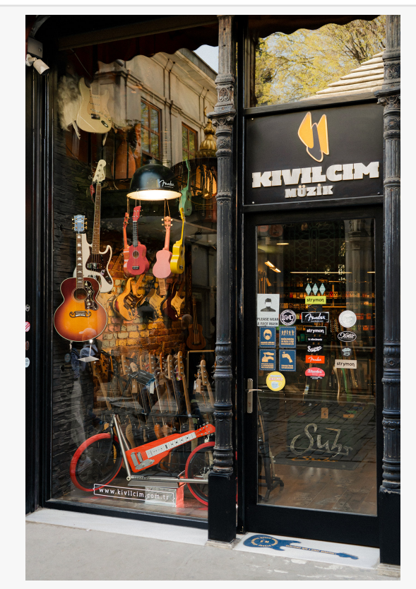
TOZZ bike Pipegun #1 Serial No 07/20 is at display of Kıvılcım Music, Beyoglu.

production in 1981. After following years the company grew with both production and sales of instruments. Currently the company is famous with their great portfolio of limited edition custom built guitars, effect pedals and other instruments. Different Nik Huber models, Fender Custom Shop Masterbuilt Series including Kraken Edition and many different Suhr electric guitar models can be considered as a sneak peek to their collection.