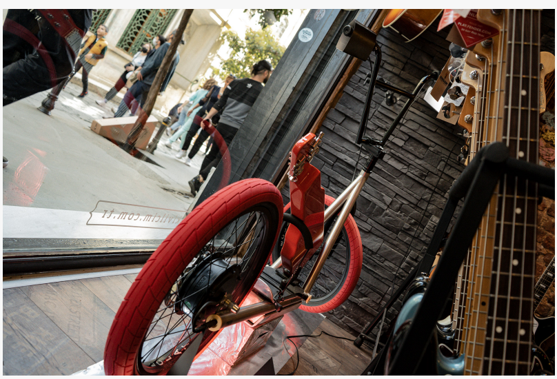
TOZZ bike Pipegun #1 at display with crowd.