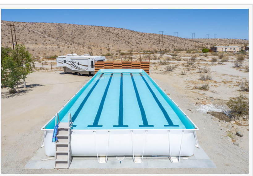
10m x 25m EZ Training Pool

An EZ Lap Pool uses all American-made components. From the durable all-steel