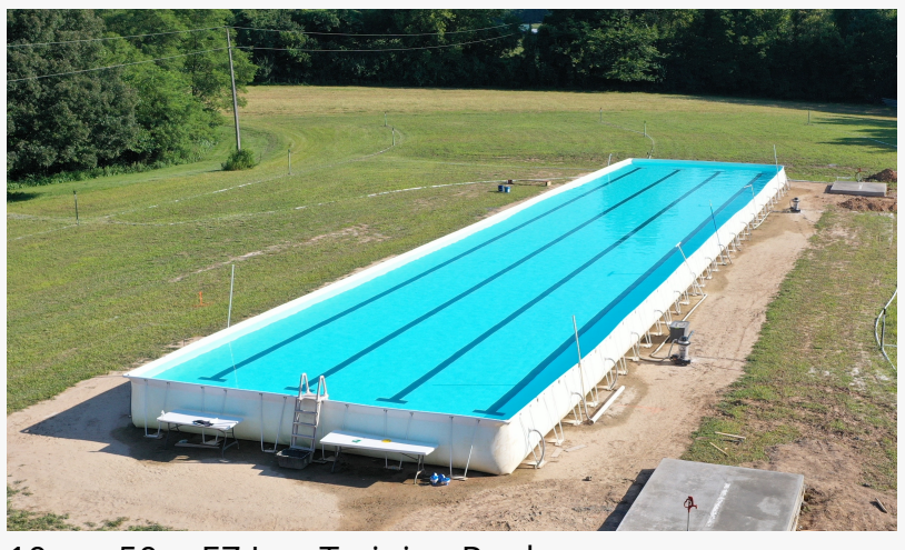
10m x 50m EZ Lap Training Pool

frame to the poly-reinforced vinyl used for the pool material - every EZ pool is made with such quality that it can outlast your need. The steel frame is hot-dipped galvanized and zinc-plated, with the exposed parts being powdercoated. From the moment you begin assembling your EZ Lap Pool, you will quickly feel the substantial durability of the frame parts. The coated polyreinforced material is also all American-made. Very similar to what the military uses for its inflatable boats, this quality material is durable