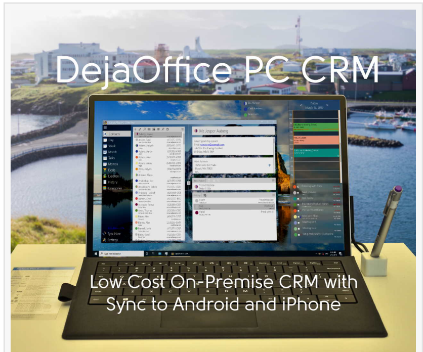
DejaOffice PC CRM - Affordable On-Premise CRM with Android and iPhone Sync

DejaOffice PC CRM Pro sells as a 3-user license for $199. 95 as a one-time price, which is $66 per user one-time price. Each user has a unique login id. They can schedule Contacts, Calendars, Tasks, and Notes to themselves or any other user and decide whether the record is private or public. When a Contact or Event is Private, only the logged-in user will see it. It is still synchronized to their phone but not to anyone else's device.