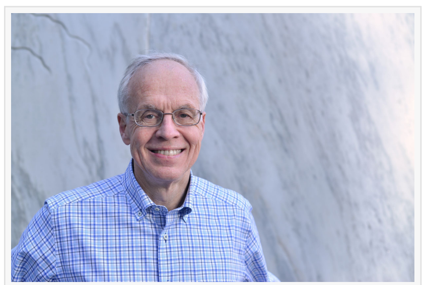
Dr. Bud Pierce, Republican Candidate for Oregon Governor in front of the Capitol Building

SALEM, OR, USA, April 19, 2022 /EINPresswire.com/ -- Dr. Bud Pierce, a Republican candidate for Oregon Governor, spoke out today about reports that affect our educational system. No longer is the Department of Education (DOE) just focusing on educating students in math, science, reading, and writing. Gender identity and sex-ed topics are being introduced to children as young as five.