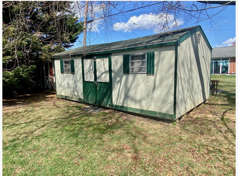
703 S. Fountain Green Rd., Bel Air, MD 21015