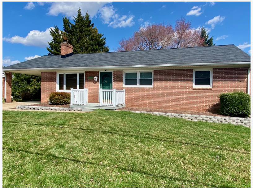
703 S. Fountain Green Rd., Bel Air, MD 21015