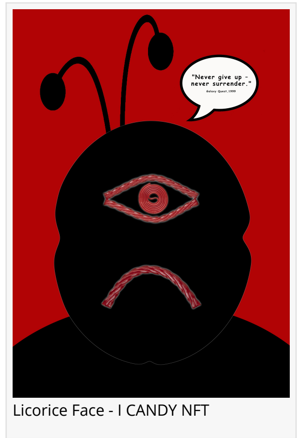
Licorice Face - I CANDY NFT

This press release can be viewed online at: https://www.einpresswire.com/article/569156745