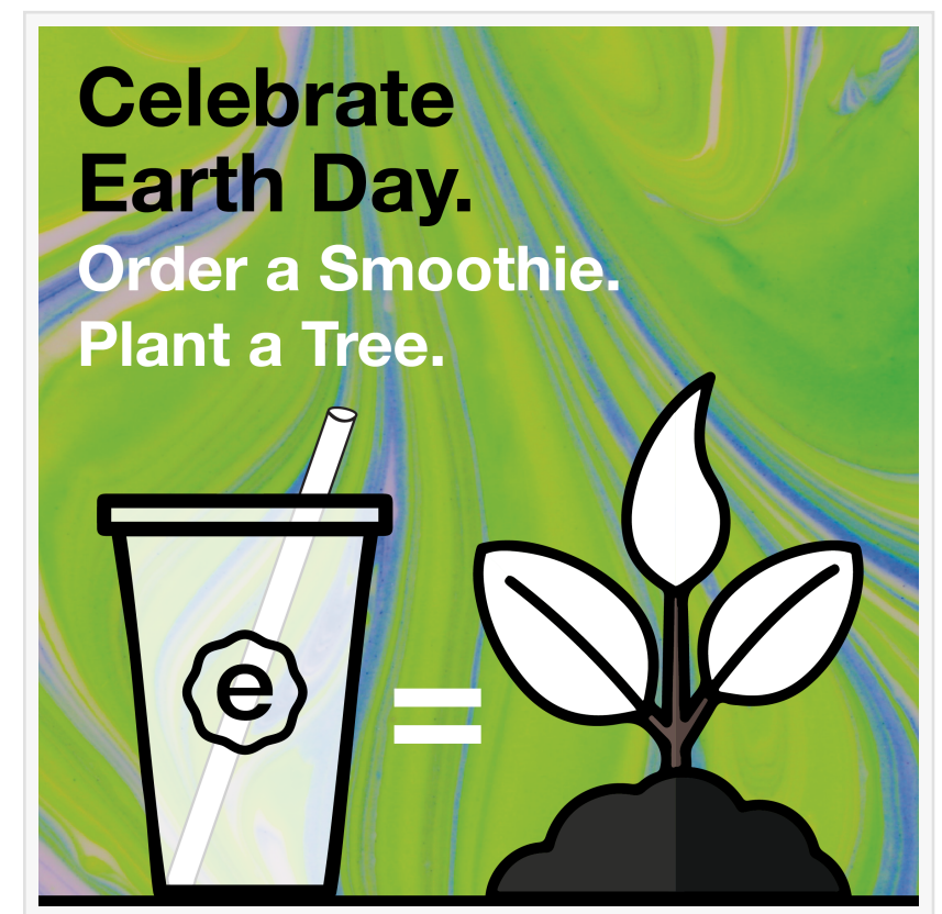
Earthbar is teaming up with One Tree Planted to help you make an impact this Earth Day

LOS ANGELES, CA, UNITED STATES, April 20, 2022 /EINPresswire.com/ --Earthbar, a leader in the wellness space for over 50 years, announced today a series of new initiatives and partnerships that will help people plant trees, give back, and feel great this Earth Day. With a long-standing mission to help you be more than well, Earthbar has long been the go-to spot for handcrafted superfood smoothies, delicious healthy meals and snacks, and a highly curated selection of innovative supplements. Core to Earthbar's mission has always been a desire to give back to our planet, and that mission takes another step forward this year at earthbar.com and in Earthbar locations across California.