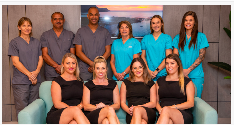
The Integra Dental Robina Team