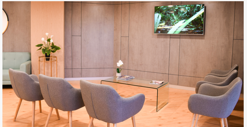
Inside The Integra Dental Practice