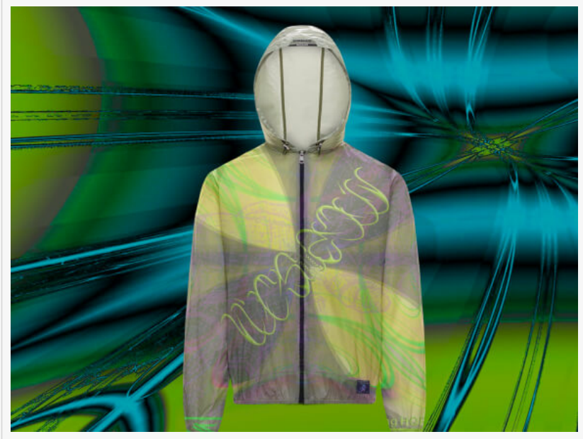
popular fabric patterns 2023

It is hard to keep good track of fashion trends in textile and apparel as evolution in designs and apparel materials is taking place regularly. Except for the ubiquitous T-Shirts, all other apparel of fashion and fabric have either disappeared or have rolled over into a new design form. What was style a few months back could easily become outdated when a new season begins.