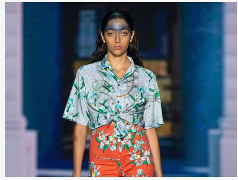
graphic design fabric

for the fashion design supply chain and other trends in textiles and apparel for its community.