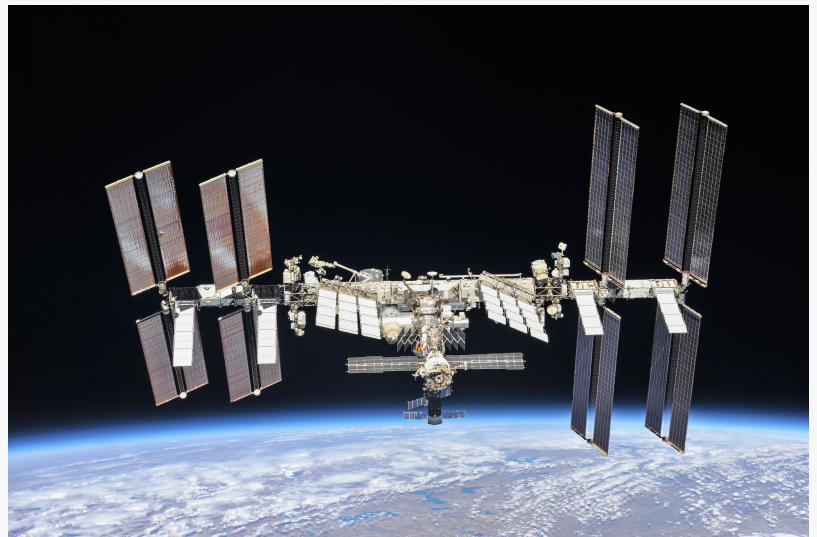
International Space Station in Earth orbit.

tokens signify ownership in NFTs2Space Distributed Autonomous Organization (DAO), including voting rights. Over 2.3 million NTOS tokens have been distributed to the NFTs2Space community to date.