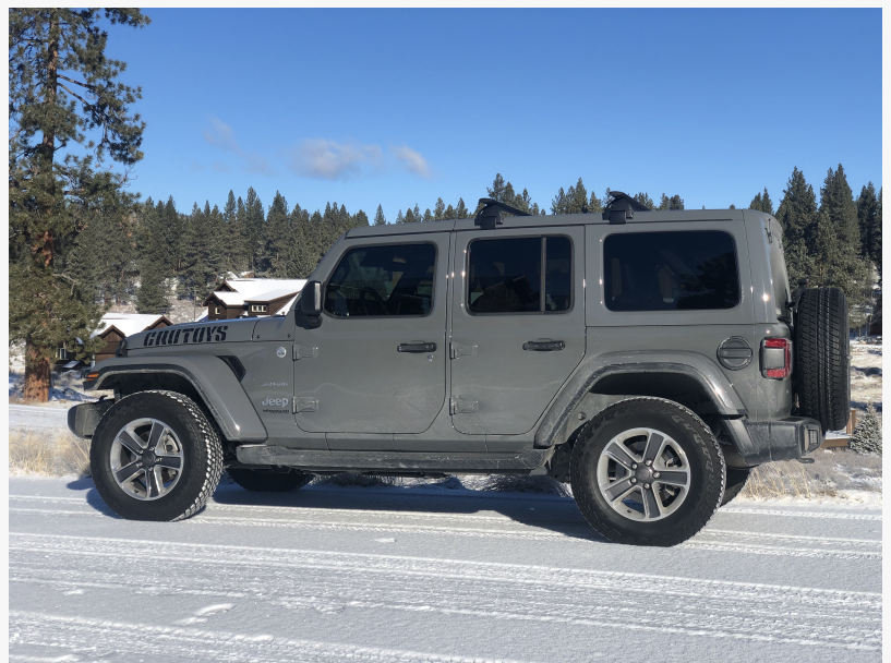
CoolToys on the Road - pre shelter that is

Scott Bourquin CoolToys TV +1 949-272-0611 scott@cooltoys.tv Visit us on social media: Facebook