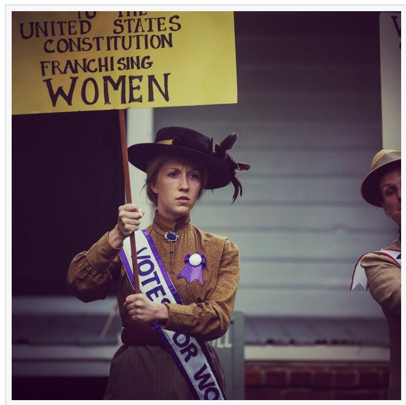
Suffragettes circa 1910s

With broadcast and independent budgets ever tightening - the company is positioned to offer incredible production-value to meet the needs and budgets of a wide variety of clients from around the World. "Anyone can afford compelling HD and 4K footage from us," adds Hershberger.