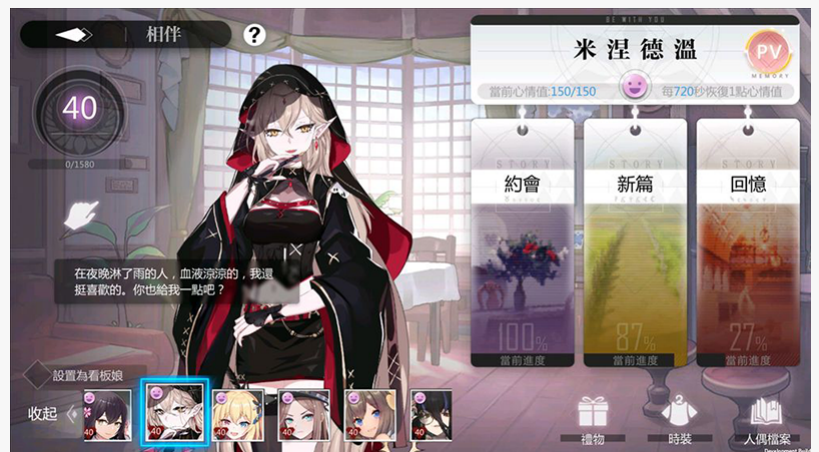
Soul Tide: Impeccable Gameplay and Interactive Experience□Dino Game□