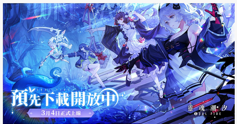
Soul Tide: An Epic Story of a Fantastic Collapsed World□Dino Game□

Soul Tide's story takes place in a fantastic magical world, overwhelmingly ruled by evil forces after a catastrophic earthquake. Players will play the role of a puppet master, commanding different types of puppet girls to explore the labyrinth, guard the town and uncover the truth behind the collapse of the world. Such an otherworldly backstory full of magic and myths is still very unique even among the many successful games released by Dino Game, deeply captivating plenty of longtime fans of this company.