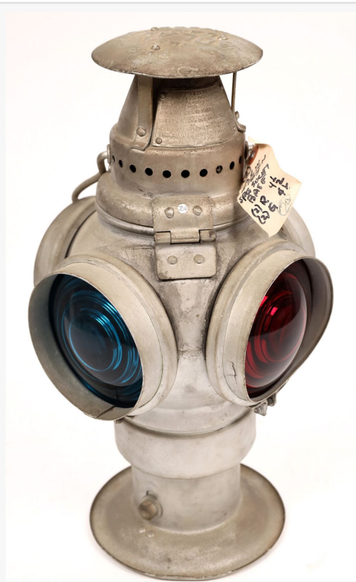
ADLAKE (short for "Adams and Westlake") non-sweating red and blue lens lamp, 16 inches tall. ADLAKE did business in Chicago and Elkhart, Indiana (est. $200-$300).

Holabird Western Americana Collections, LLC is always seeking new and major collections to bring to market. It prides itself as being a major source for selling Americana at the best prices obtainable, having sold more than any other similar company in the past decade alone. The firm will have its entire sales database online