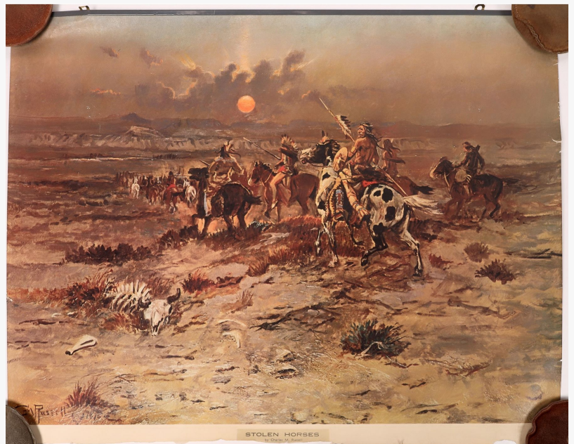
Lot 4234 is a group of seven prints by the famed Western artist Charles M. Russell (1864-1926), each one rolled up and with metal clasps on the top for wall hanging (est. $300-$400).