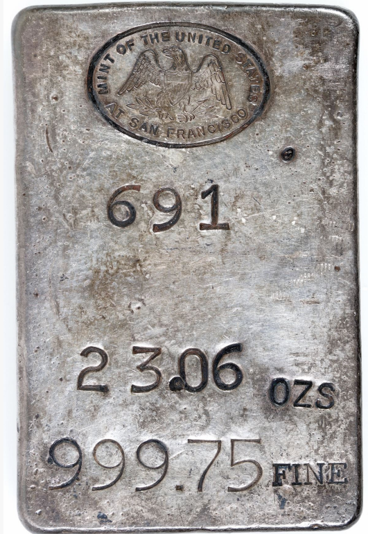
US Mint San Francisco 23.06-ounce silver ingot, 999.75 fine, sizable at 2 ¼ inches by 3 ½ inches, with original Mint patina strong throughout (est. $5,000-$9,000).

Lot 4234 is a group of seven prints by the famed Western artist Charles M. Russell (1864-1926), each one rolled up and with metal clasps on the top for wall hanging (est. $300-$400). Russell created over 2,000 paintings of cowboys, Indians and landscapes set in the Western United States and in Alberta, Canada, in addition to bronze sculptures. He was known as "the cowboy artist".