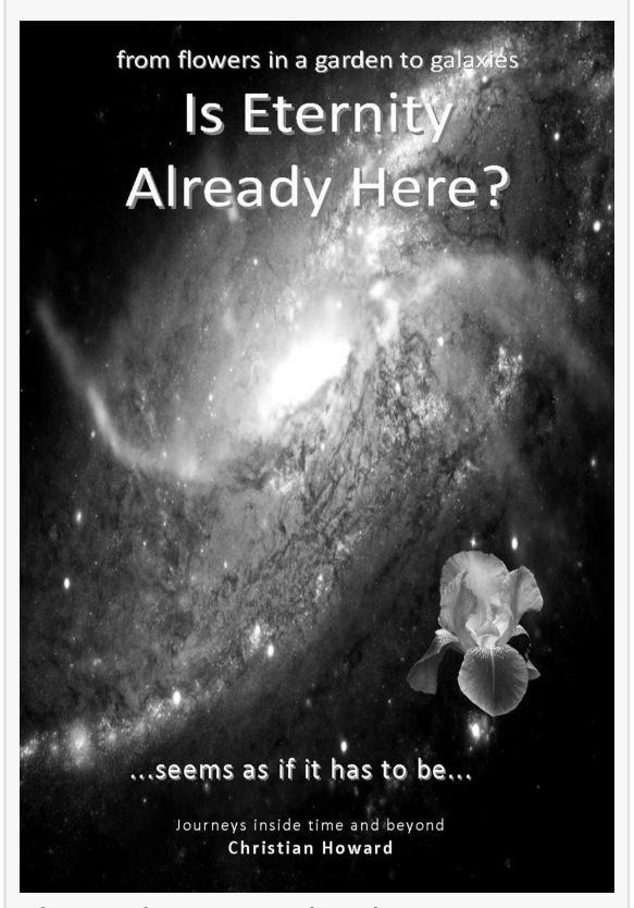
The author's new book

what to look forward to when it is our turn to leave this world behind."