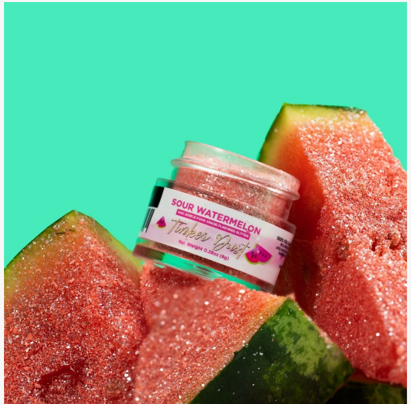
Sour Watermelon Flavored Tinker Dust® Edible Glitter

10 Amazing Sweet & Sour Flavors Available: Sour Wild Cherry, Sour Orange, Sour Fruit Punch, Sour Green