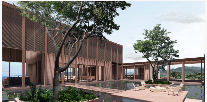
Design opportunities to fit your taste