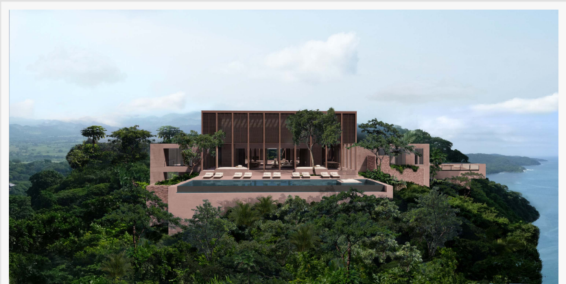
Exclusive private property atop the cliffs of Mandarin

At 800 feet above sea level, the crown jewel of Mandarin sits perfectly positioned for sunrise to sunset ocean views. The property itself enjoys 60 linear meters of frontage to the east with 6,500-foot-high mountain views, while overlooking Playa Canalan, a one-mile-long pristine beach. Experience another incredible 50 linear meters of frontage to the north with infinite views of the sandy coastline and ocean panorama, as well as enjoying resort views of the jungle canopy. To the west yet another 60 linear meters of architectural frontage expand as the perfect canvas to enjoy sunset ocean views and the southern coastline. Of the 55 villas planned for One&Only Private Homes, only eight lots boast this immaculate location, with this premium property offering the most exclusivity, even among its neighbors. This offering includes the opportunity to design a bespoke villa to any specifications by renowned architects at Studio Caban, with plans that