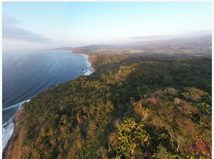
800 feet above sea level with unobstructed ocean views