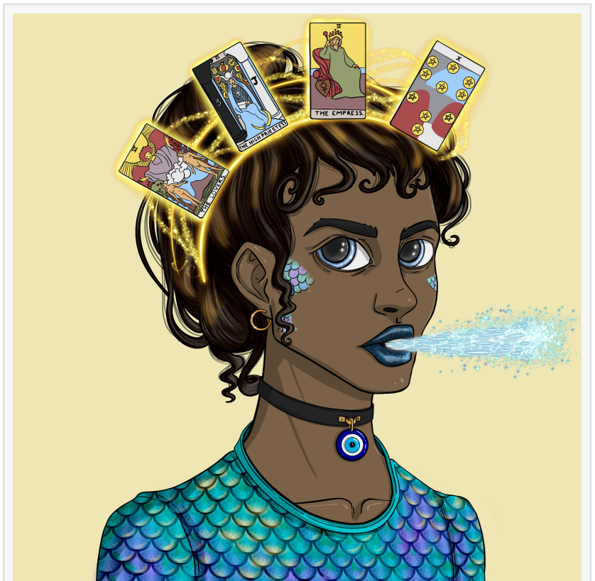
Myra the Mermaid. Myra wears a golden crown of tarot cards that everyone would want in their spread. Her iridescent shirt doubles as scales when she takes to the water and her face has scales to match. Her powers include being able to shoot streams of ice