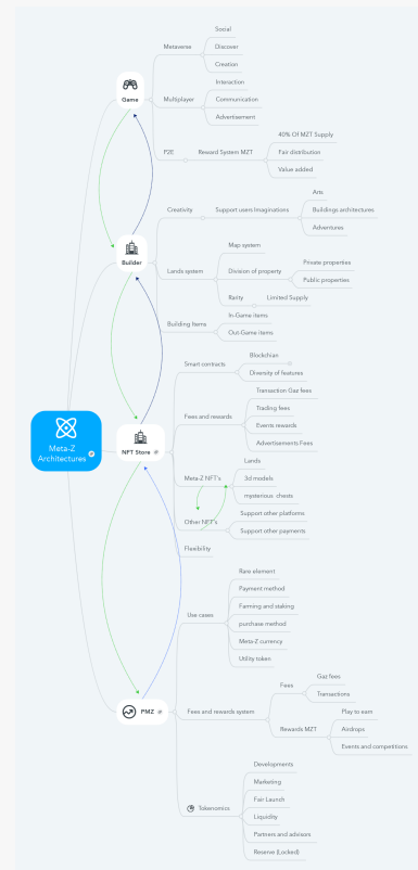
Meta-Z project description