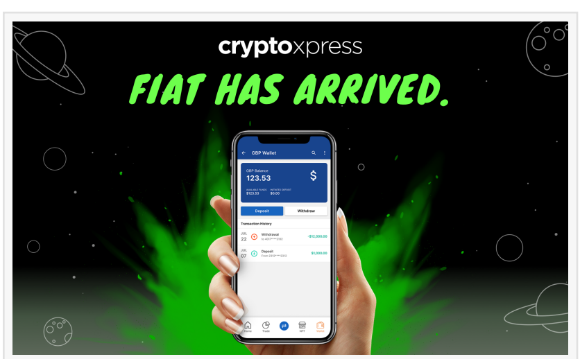
Fiat has arrived in the CryptoXpress app.

What this means for CryptoXpress users is that they can now invest in 1000+ cryptocurrency pairs, NFTs, and many other digital assets and services