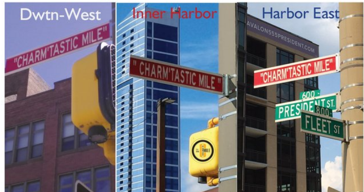
The Charm'tastic Mile Famed (3) Street Signs

The "Charm'tastic Mile" concept & the book We Own This City both have roots planted to the aftermath of the Freddie Gray death and riots. The Mile was created like the Inner Harbor pavilions in 1980 as a new branding movement to improve the overall brand of the city giving it a Famous/Iconic Street like The Mag Mile (Chicago), Bourbon Street (New Orleans), Wall Street & Broadway (New York) and Rodeo Drive (Beverly Hills).