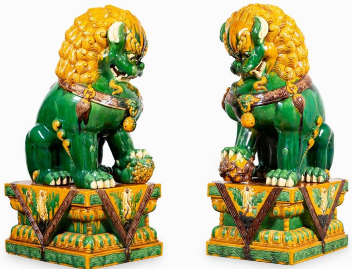
Monumental pair of Chinese Sancai glaze ceramic seated Buddhist lion figures on stands, 57 inches tall, the male standing on a brocade ball and the female with her cub ($5,938).