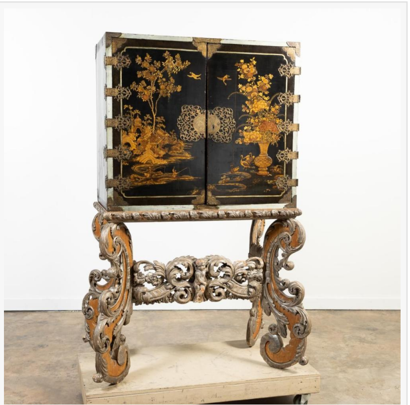
Late 18th/early 19th century William and Mary parcel gilt and black lacquer Japanned cabinet on a stand, the cabinet decorated with a riverscape, foliage and birds ($10,625).